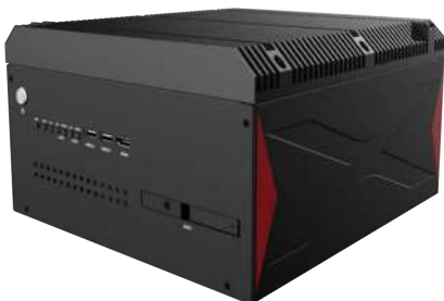
*Rear angle w/o expansion modules